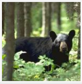
How To Avoid A Bear Attack