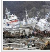
Japan Disaster Videos