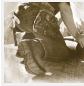
Georgia Work Boots