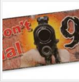
9 Rural Security Techniques